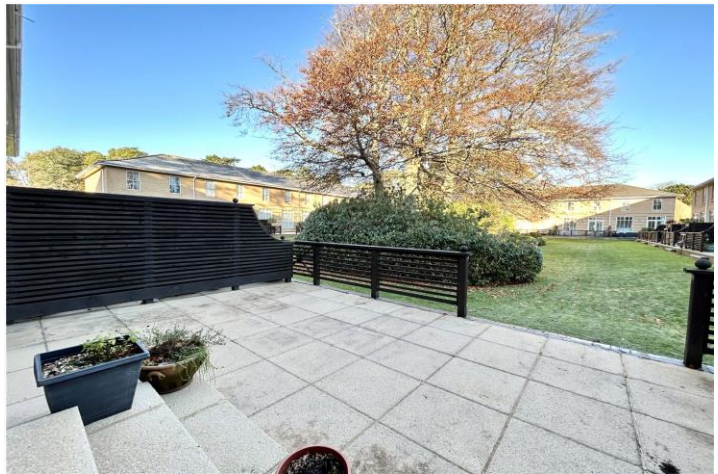
CERNE ABBAS, THE AVENUE, POOLE, BH13