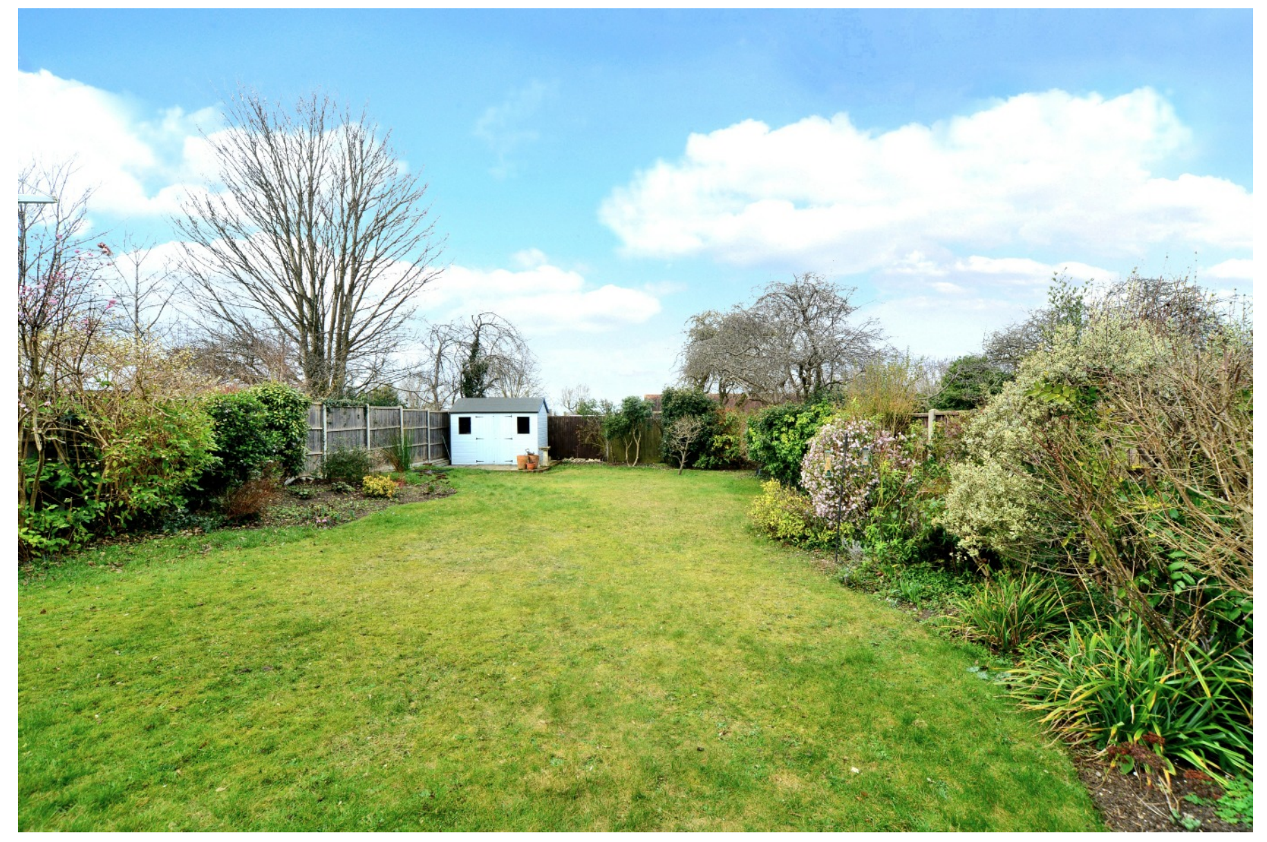
Under the Consumer Protection Regulations 2008, these Particulars are a guide and act as information only. All details are given in good faith and are believed to be correct at time of printing. Winkworth give no representation as to their accuracy and potential purchasers or tenants must satisfy themselves by inspection or otherwise as to their correctness. No employee of Winkworth has authority to make or give any representation or warranty in relation to this property.