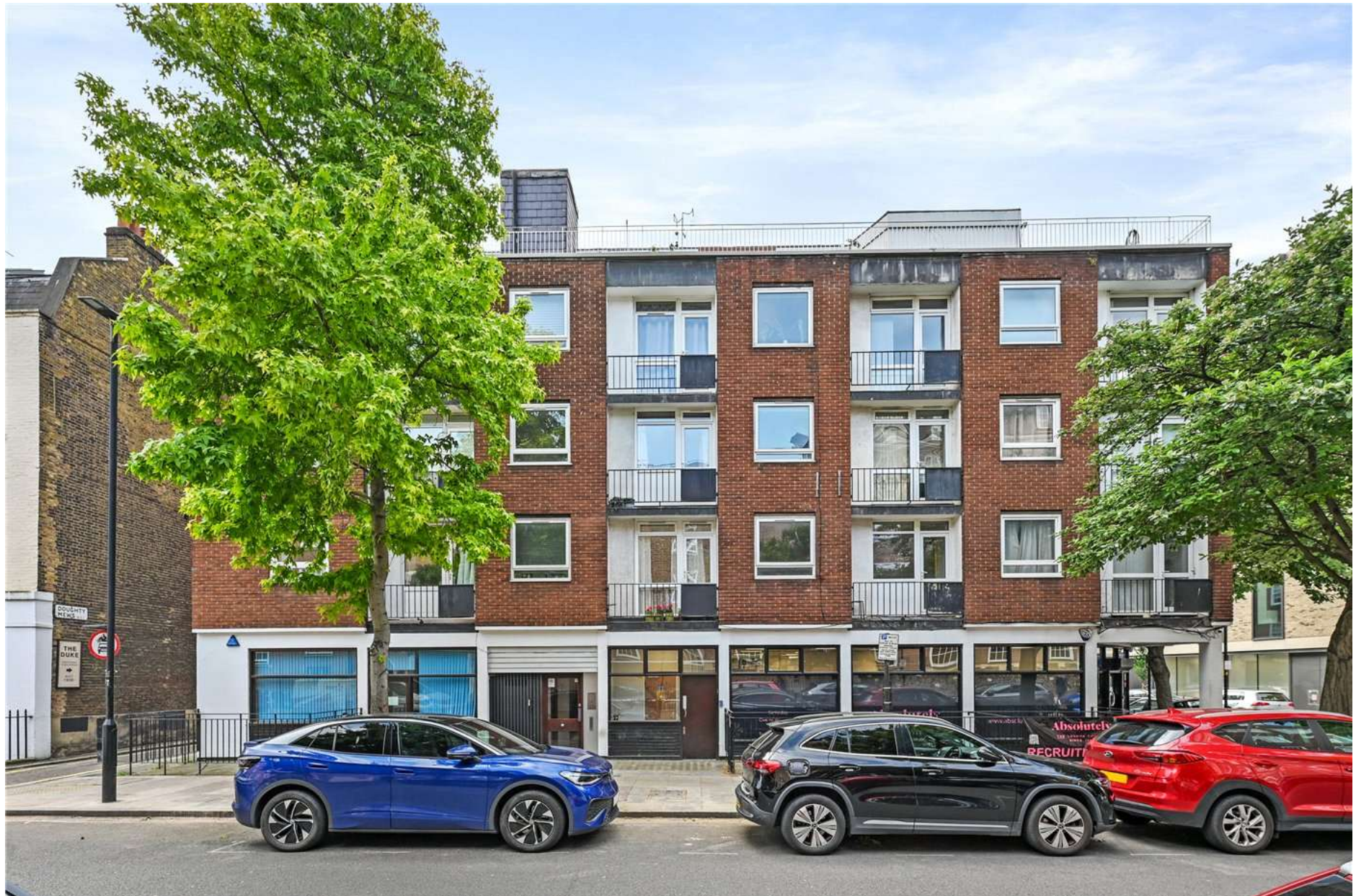
GUILFORD STREET, WC1N £475,000 LEASEHOLD