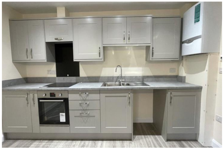
2 GAVEL COURT, MARKET PLACE, DEVIZES, SN10 £695 PER MONTH