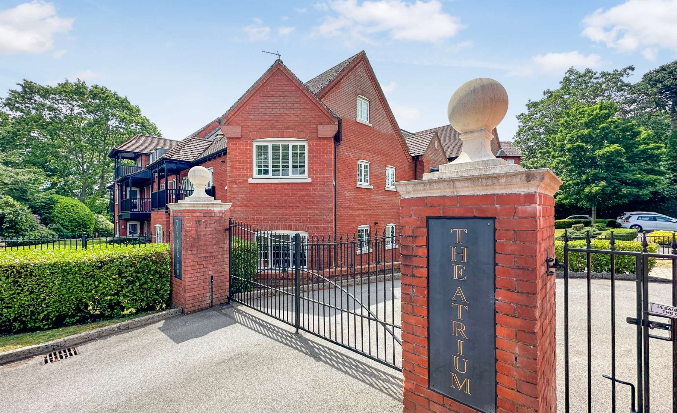
The Atrium, Whincroft Close Ferndown BH22 9NS GUIDE PRICE £270,000