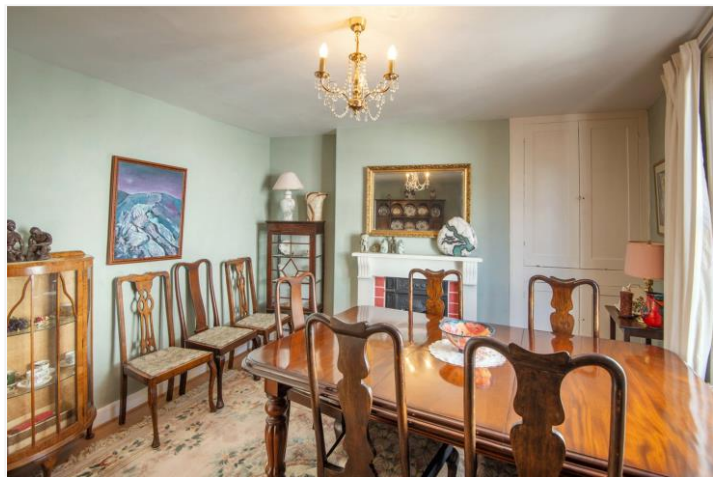
SMITH STREET, DARTMOUTH £495,000 FREEHOLD