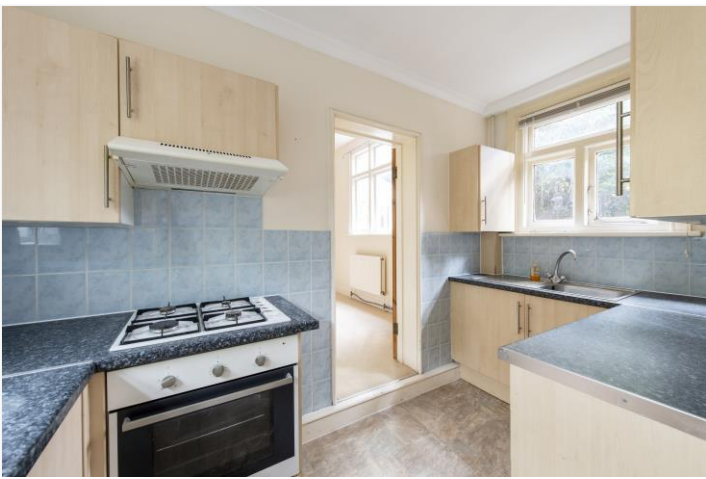
BECMEAD AVENUE, SW16 £1,650 PER MONTH UNFURNISHED