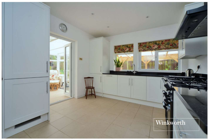
LONDON ROAD, CHEAM, SUTTON, SM3 £725,000 FREEHOLD

A SUBSTANTIAL THREE BEDROOM DETACHED BUNGALOW BENEFITTING FROM A 100FT APPROX. REAR GARDEN LOCATED WITHIN WALKING DISTANCE OF NONSUCH PARK