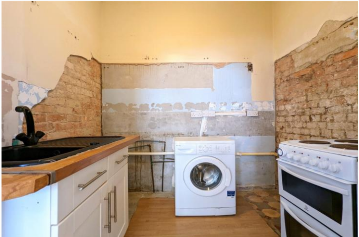
FLAT 4, NAPIER COURT, DURLEY GARDENS, BOURNEMOUTH, BH2