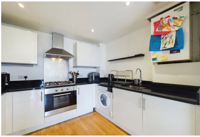
TRIANGLE ROAD, LONDON, E8 £425,000 LEASEHOLD