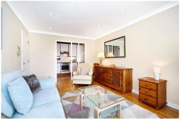
BEECHWOOD GROVE, LONDON, W3 £1,675 PER MONTH FURNISHED £1,675 PER CALENDAR MONTH

A well-presented one double bedroom flat located in this attractive development with communal gardens and allocated off road parking. Furnished. Available 18th April 2024