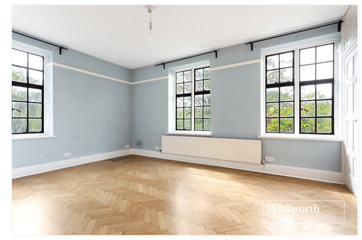
WIDECOMBE COURT, EAST FINCHLEY, LONDON, N2 £450,000 LEASEHOLD