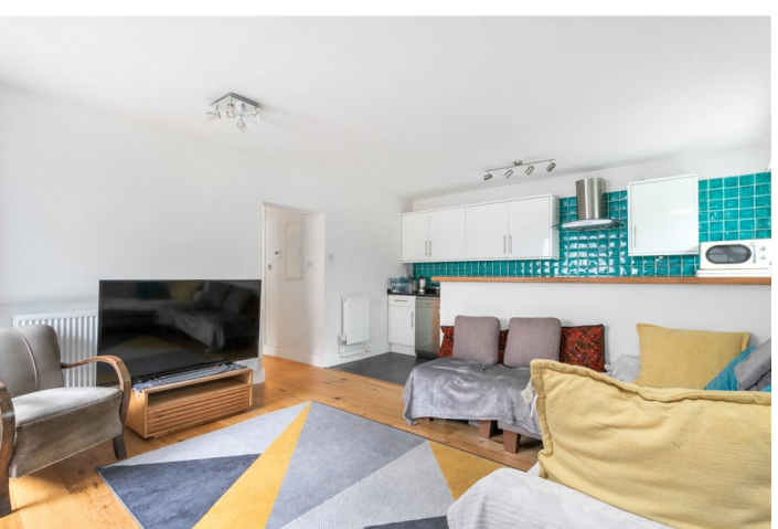
PETTICOAT TOWER, PETTICOAT SQUARE, LONDON, E1 £350,000 LEASEHOLD