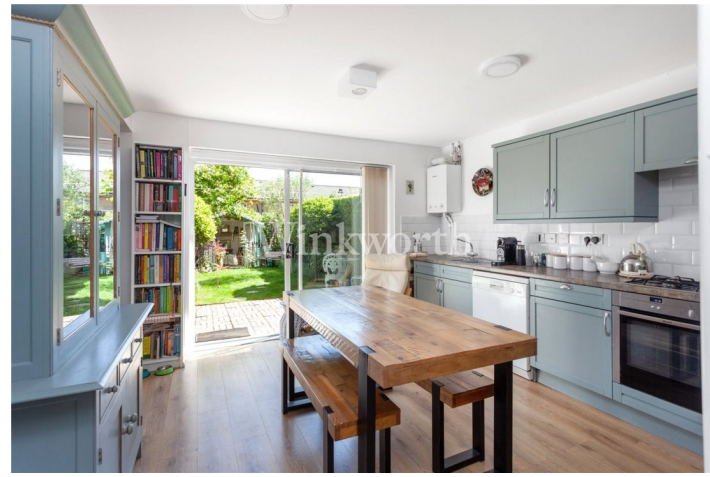
MYDDLETON AVENUE, LONDON, N4 £925,000 FREEHOLD