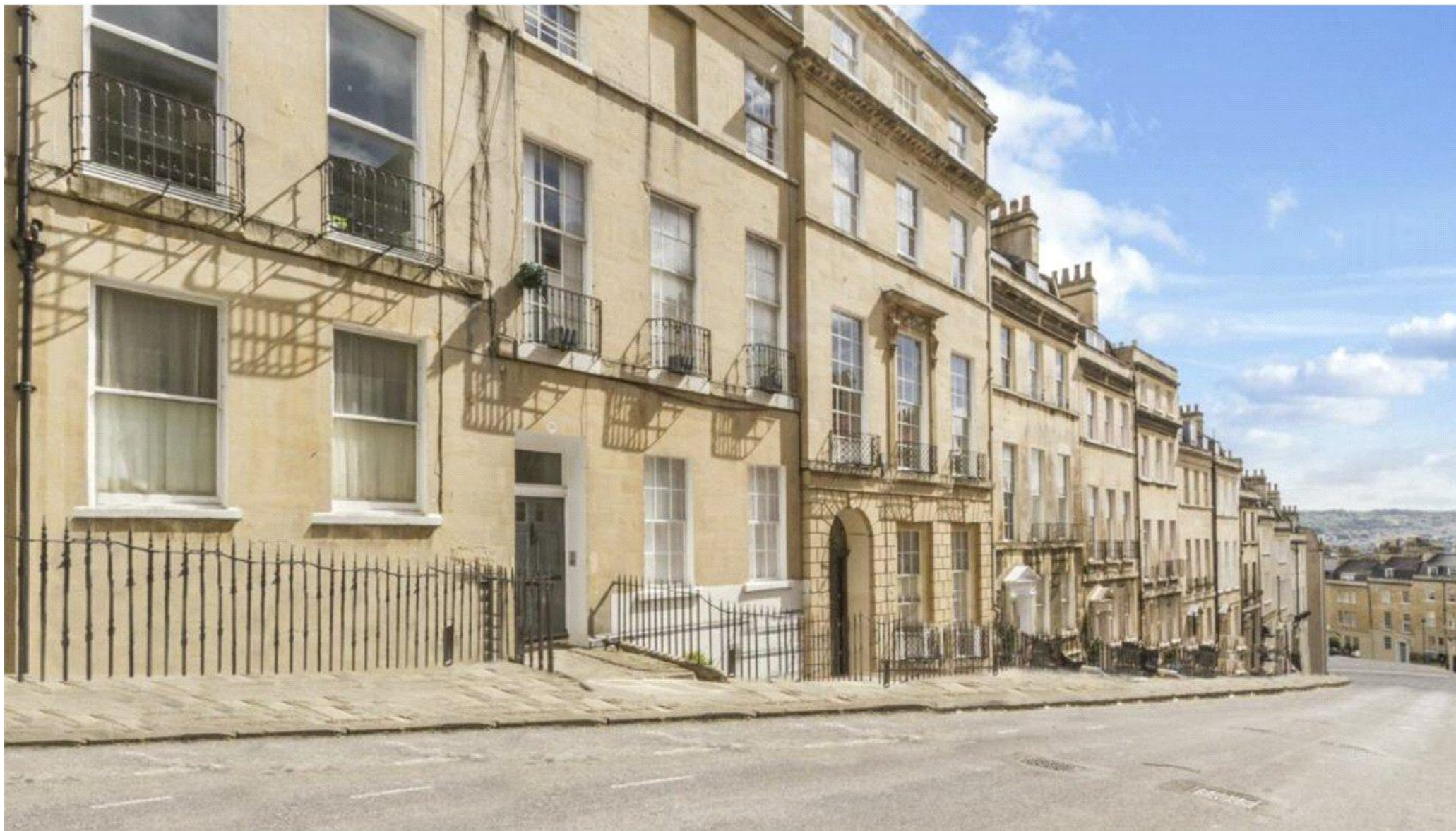
PARK STREET, BATH, BA1 £498,000 LEASEHOLD