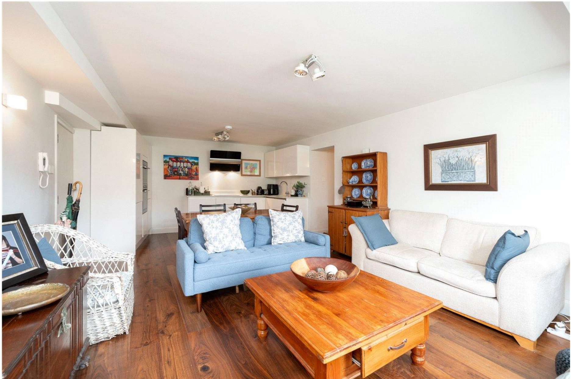
SOUTHFIELDS COURT, SW19 £725,000 LEASEHOLD