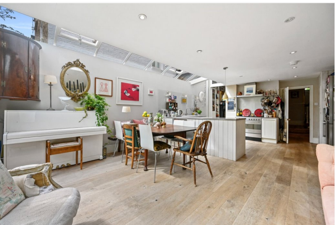
Ingersoll Road, W12 £1,550,000 Freehold

A delightful five bedroom, bay fronted Victorian house on this ever popular street in Shepherd's Bush.