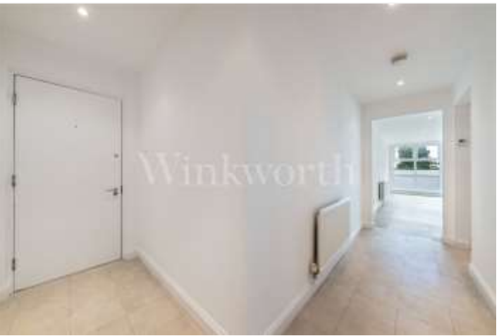
CRICKLEWOOD LANE, NW2 £575,000 LEASEHOLD