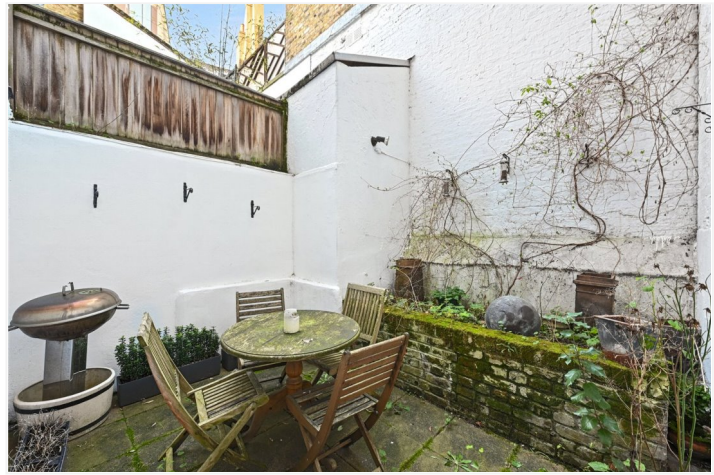
STRATHMORE GARDENS, W8 £799,999 SHARE OF FREEHOLD

A SPACIOUS TWO BEDROOM PATIO GARDEN FLAT SITUATED ON THE LOWER GROUND FLOOR OF AN ATTRACTIVE STUCCO FRONTED VICTORIAN TERRACED HOUSE.