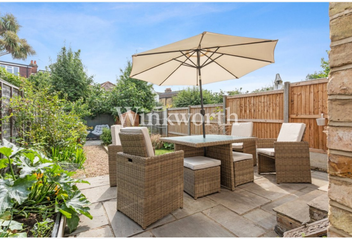
LIGHTCLIFFE ROAD, N13 OFFERS OVER £400,000 SHARE OF FREEHOLD