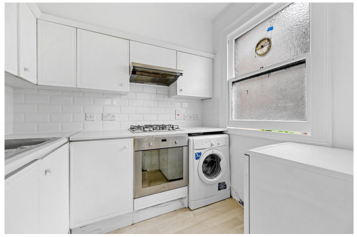
ORMISTON GROVE, W12 £360 PER WEEK FURNISHED £1,560 PER CALENDAR MONTH

A one double bedroom flat arranged over two floors at the rear of a grand Victorian house with additional study/storage room. Furnished. Available immediately