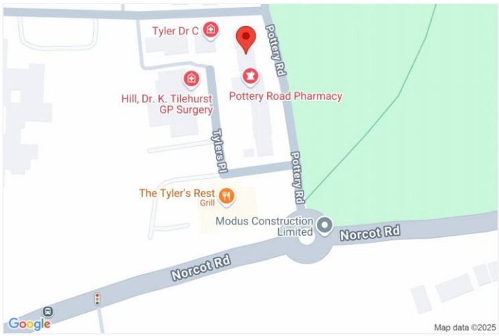
TYLERS PLACE, TILEHURST, RG30 6BW £155,000 LEASEHOLD