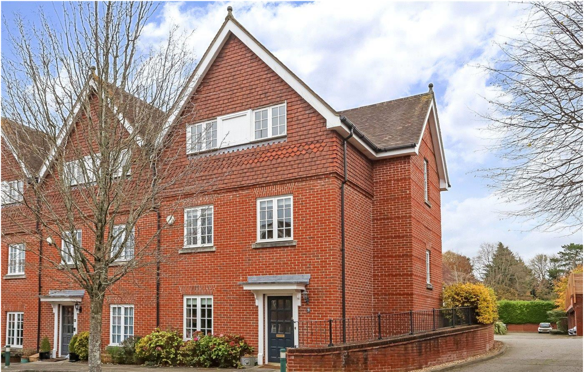
Wyewood Place, Winchester, Hampshire, SO22 6BE