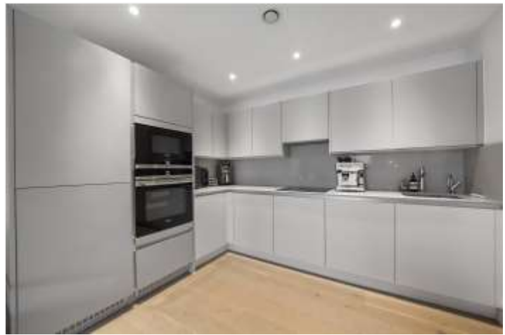
ROSSETTI COURT, ARCHWAY ROAD N6 £795,000 LEASEHOLD

A BEAUTIFULLY PRESENTED TWO BEDROOM FLAT ON THE THIRD FLOOR OF A MODERN, LIFT-SERVED APARTMENT BLOCK IN HIGHGATE.