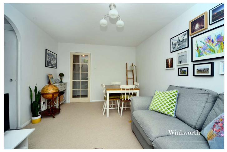
PERCY GARDENS, WORCESTER PARK, KT4 £245,000 LEASEHOLD

A BEAUTIFULLY PRESENTED ONE BEDROOM FIRST FLOOR APARTMENT WITH RESIDENT'S PARKING LOCATED CLOSE TO MALDEN MANOR STATION