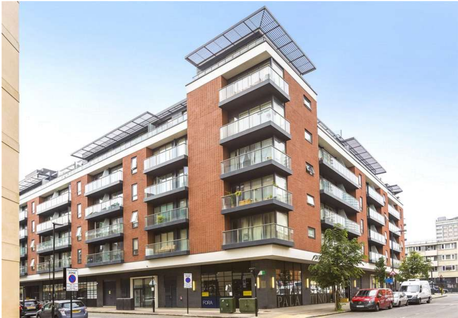
WORCESTER POINT, LONDON, EC1V £788,000 LEASEHOLD