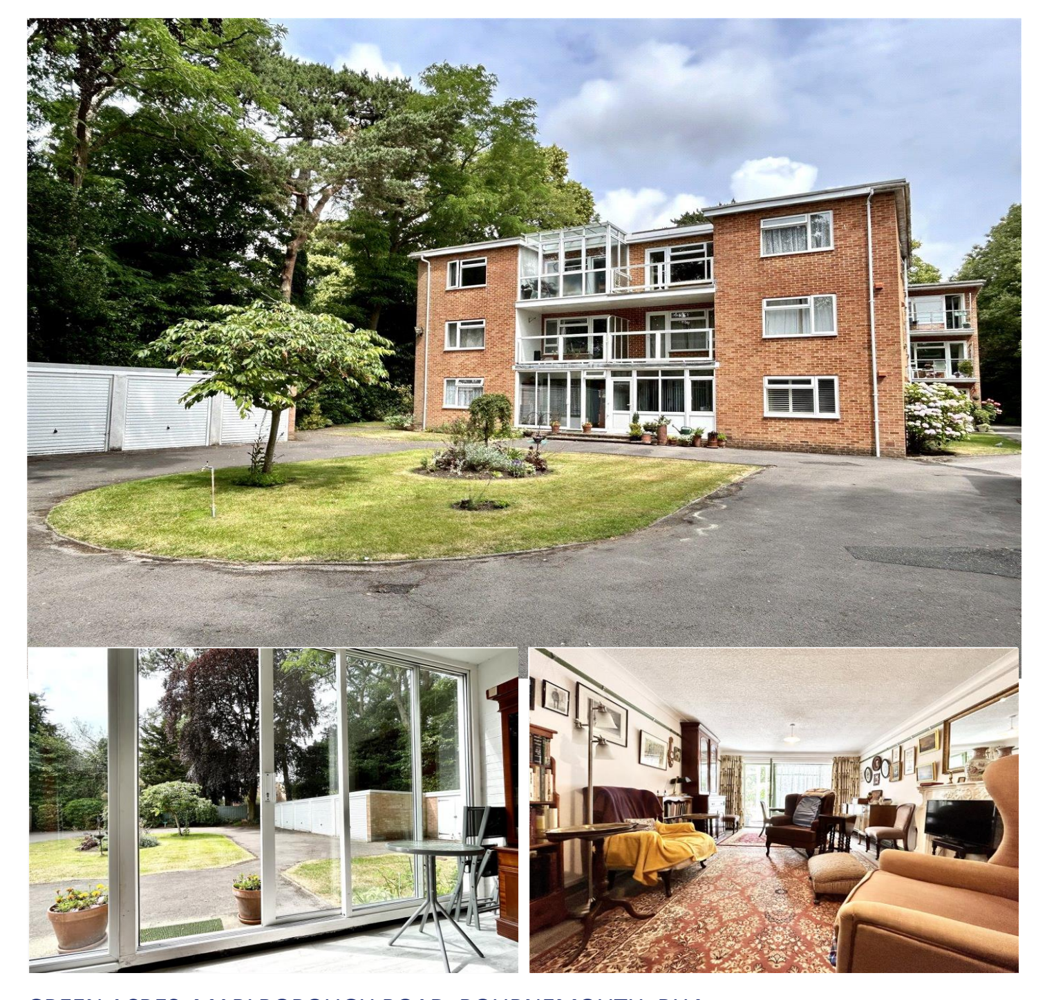
GREEN ACRES, MARLBOROUGH ROAD, BOURNEMOUTH, BH4