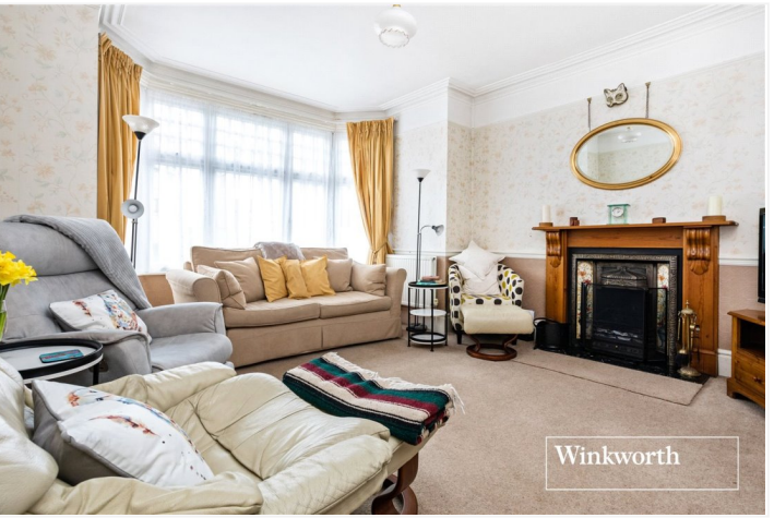
PARK CRESCENT, FINCHLEY, LONDON, N3 £1,225,000 FREEHOLD