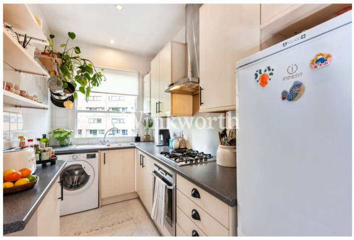
C, BROWNSWOOD ROAD, LONDON, N4 £550,000 SHARE OF FREEHOLD