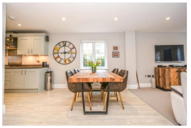
5 WOODFIELD PLACE, BINFIELD, BRACKNELL, BERKSHIRE, RG42 4FQ £600,000 FREEHOLD