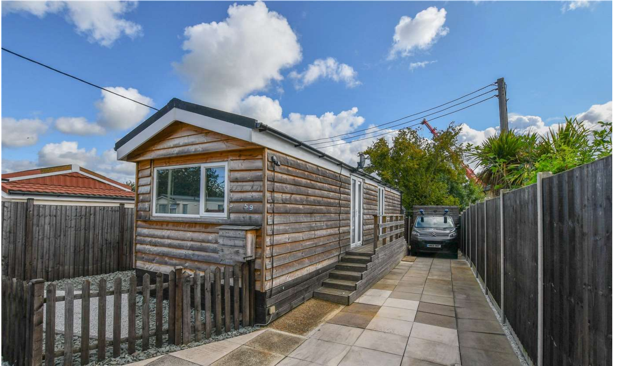
59 GROVELANDS PARK, WINNERSH, WOKINGHAM, BERKSHIRE, RG41 5LE £140,000 LEASEHOLD