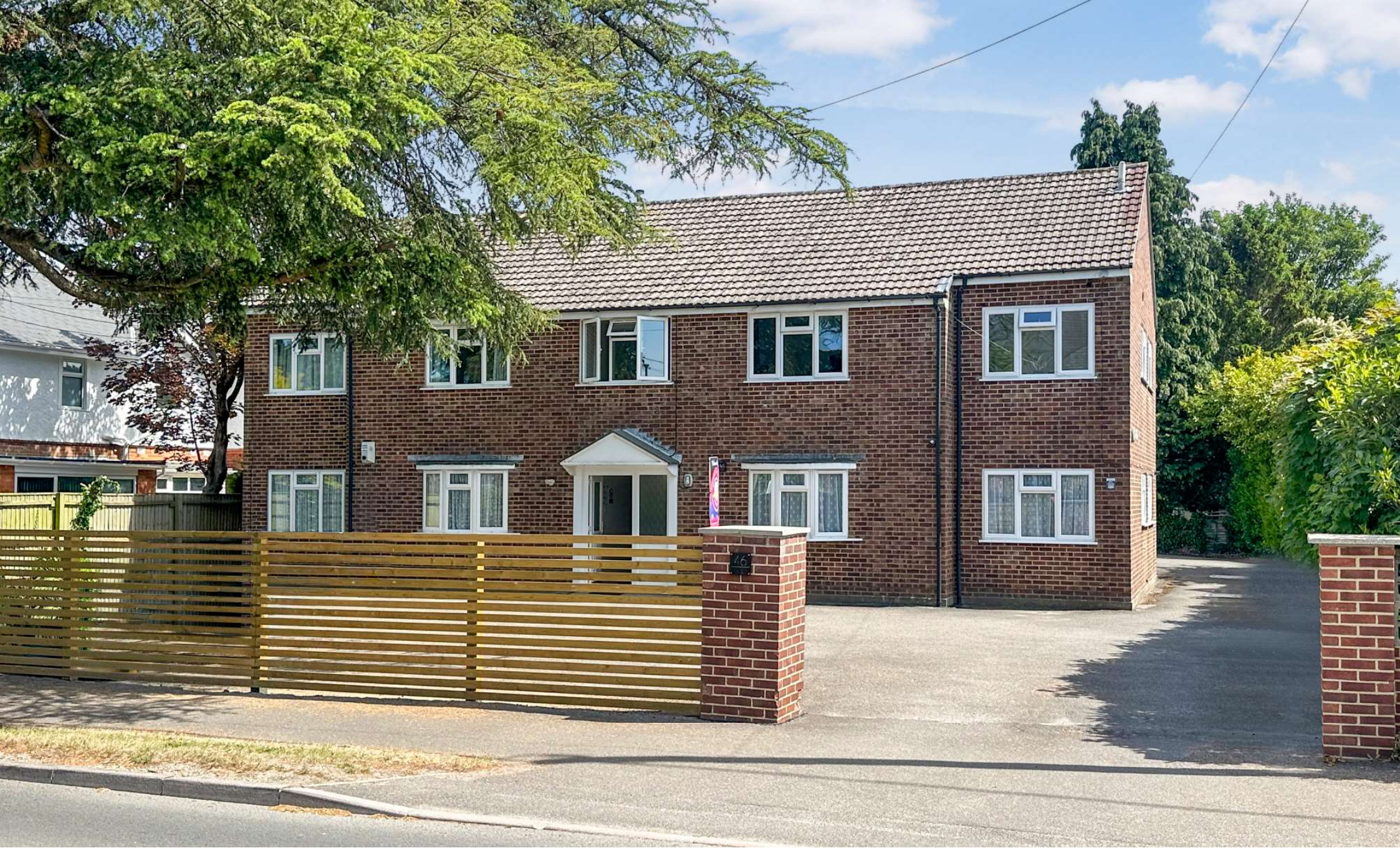
The Pines, 46 Church Road, Ferndown BH22 9EU GUIDE PRICE £300,000