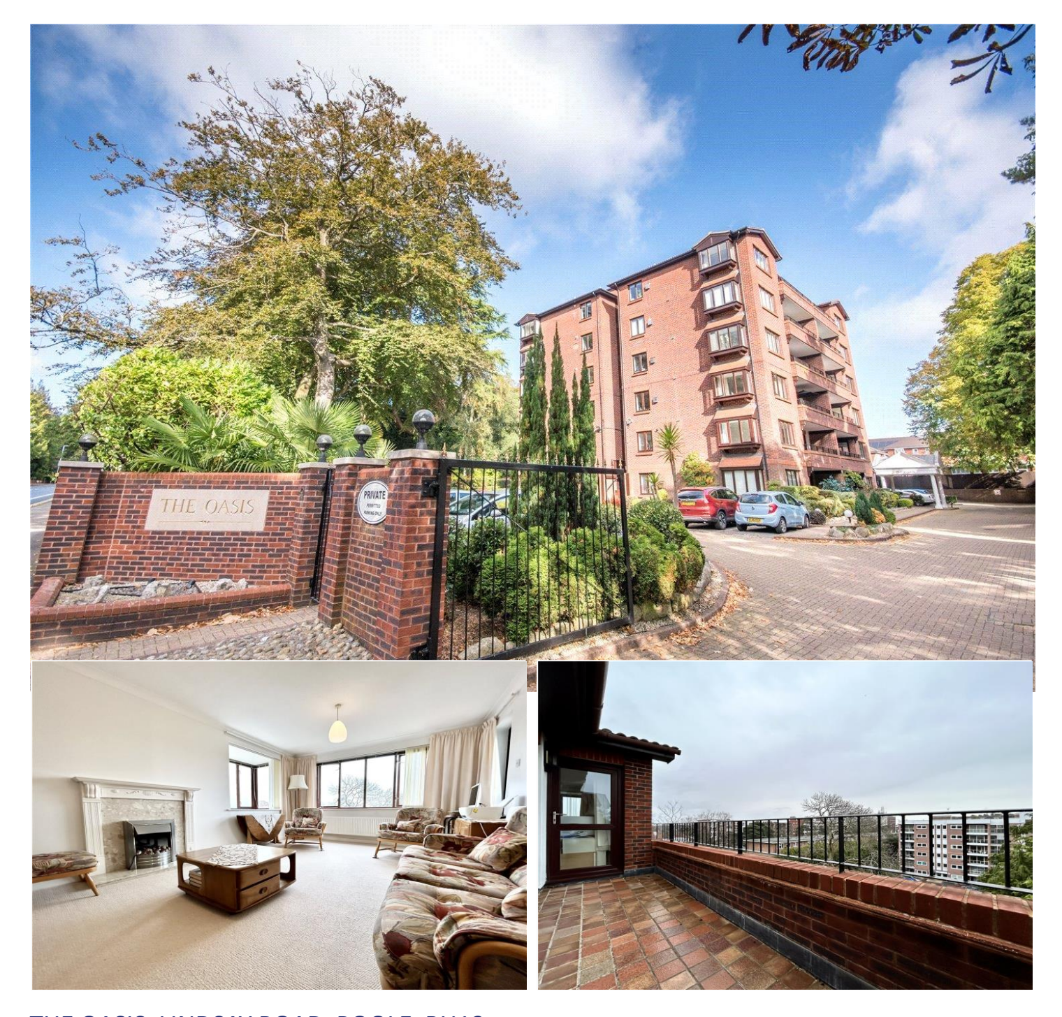
THE OASIS, LINDSAY ROAD, POOLE, BH13