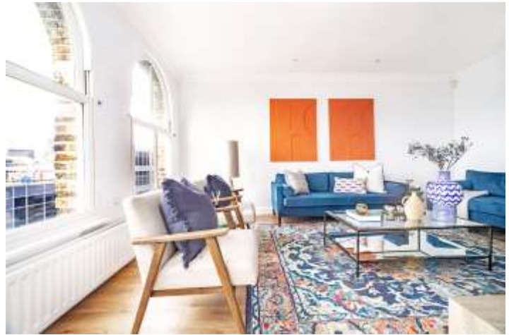
FARRINGDON ROAD, LONDON, EC1M £1,200,000 LEASEHOLD

AN EXCEPTIONAL TWO BEDROOM FLAT SET WITHIN A LATE VICTORIAN BUILDING ON FARRINGDON ROAD.