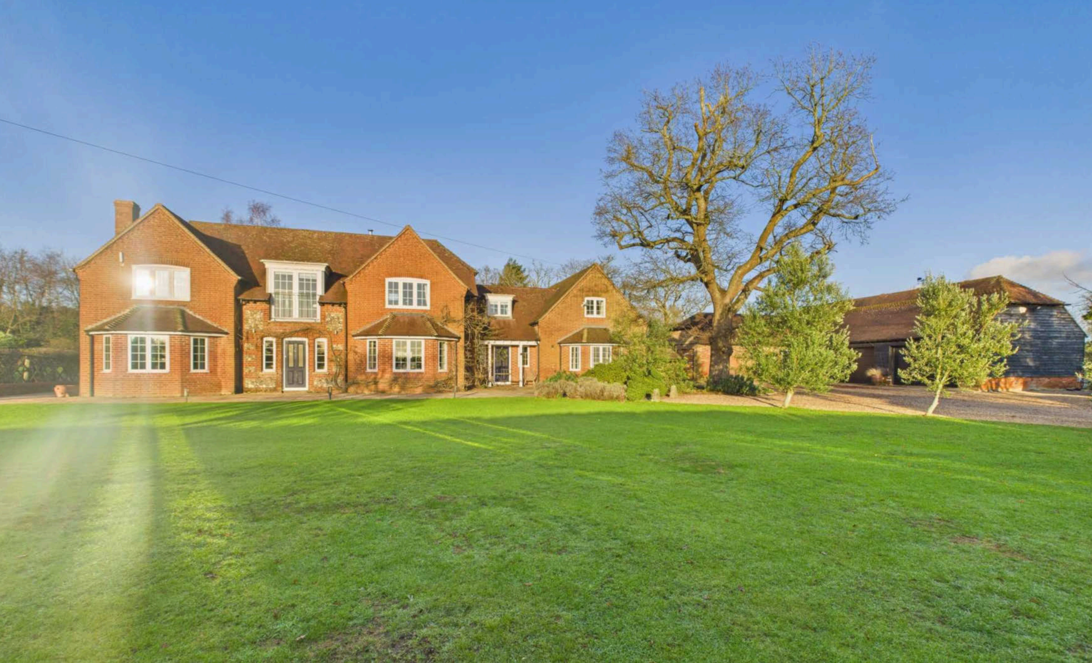
KIMBLE HOUSE, SOUTHEND, HENLEY-ON-THAMES, BUCKINGHAMSHIRE, RG9 6JP