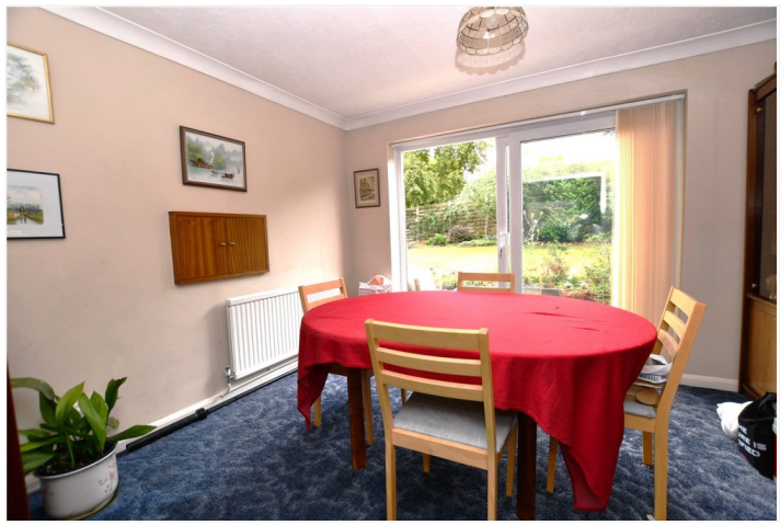
11 CAMELLIA WAY, WOKINGHAM, BERKSHIRE, RG41 3NB £725,000 FREEHOLD

A MUCH SOUGHT AFTER FOUR BEDROOM DETACHED FAMILY HOME WITH TWO LARGE RECEPTION ROOMS, REFITTED KITCHEN/BREAKFAST ROOM AND DOUBLE GARAGE ON THE SIMONS PARK DEVELOPMENT.