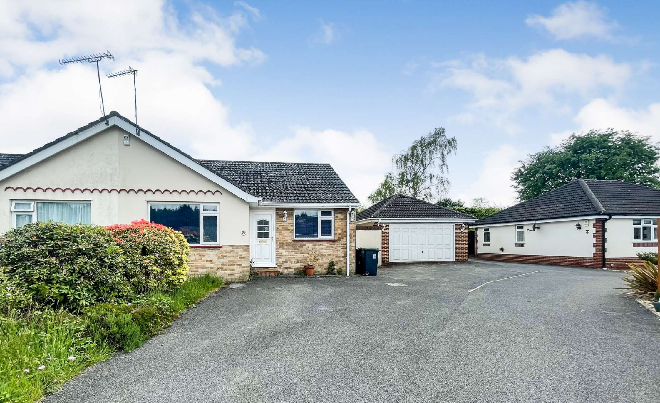
19 Leeson Drive Ferndown BH22 9QL Guide Price £375,000