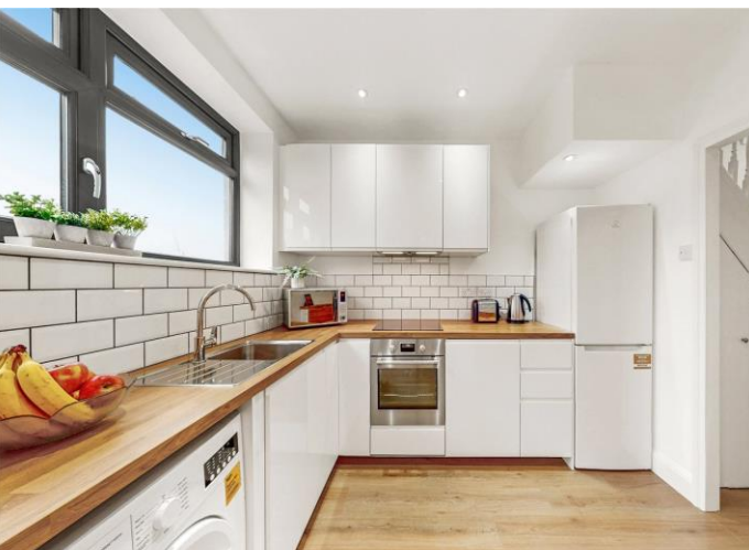
26 Bengarth Drive, Harrow, HA3 5HZ Asking Price £575000

Winkworth Harrow are delighted to offer to the market this CHAIN FREE bright and spacious three bedroom semi-detached family home.