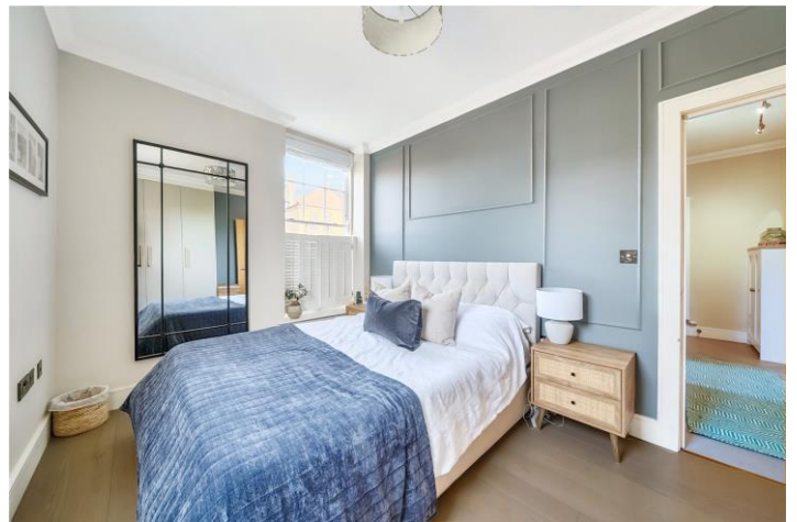
FLAT 1, CABRINI HOUSE, HONOR OAK RISE, LONDON, SE23 £450,000 LEASEHOLD