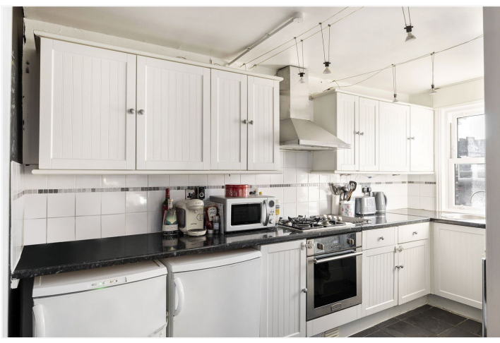
BRAILSFORD ROAD, SW2 £1,900 PER MONTH PART FURNISHED