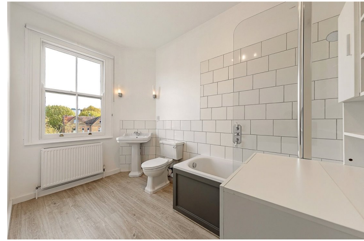
CARMALT GARDENS, LONDON, SW15 £1,950 PER MONTH UNFURNISHED