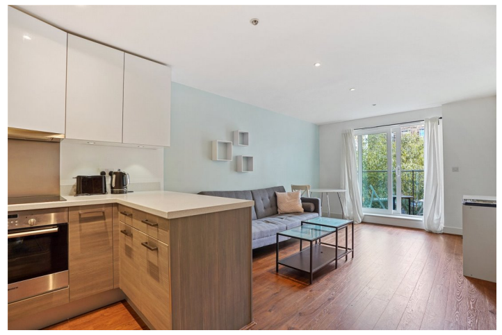
NAPIER HOUSE, LONDON, W3 £1,750 PER MONTH FURNISHED £1,750 PER CALENDAR MONTH

A modern and high spec one double bedroom apartment with over 500 sq ft of internal space and private balcony within this secure gated development. Furnished, available 22nd March 2024