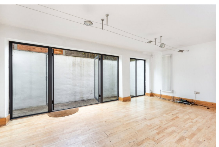
BROOKFIELD ROAD, LONDON, E9 'OFFERS IN EXCESS OF' £980,000 FREEHOLD