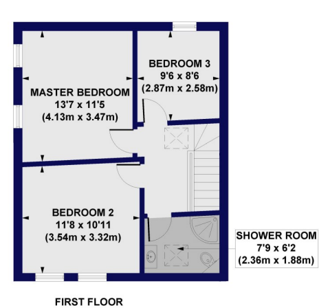
GROSS INTERNAL FLOOR AREA 510 SQ FT