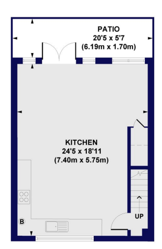
LOWER GROUND FLOOR GROSS INTERNAL FLOOR AREA 462 SQ FT