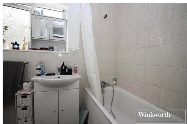
RODGERS CLOSE, ELSTREE, HERTFORDSHIRE, WD6 £1,300 PER MONTH UNFURNISHED