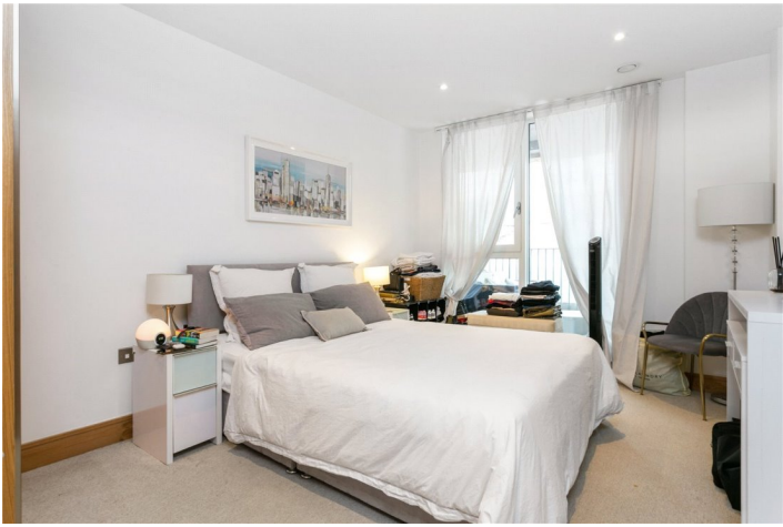
FUSION COURT, SCLATER STREET, LONDON, E1 £575,000 LEASEHOLD