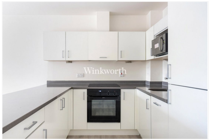
BANTAM HOUSE, LONDON, NW9 £TBC