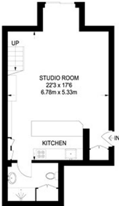
LOWER GROUND FLOOR 449 SQ FT / 41.7 SQ M

APPROXIMATE GROSS INTERNAL AREA 648 SQ FT / 60.2 SQ M