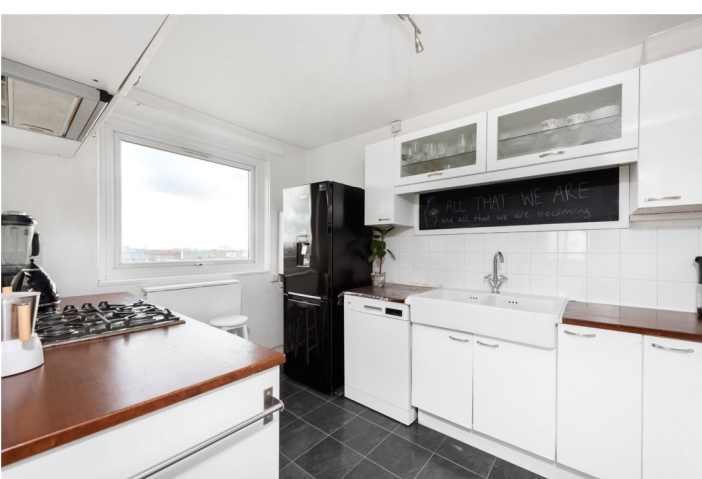
LANDMARK HEIGHTS, DAUBENEY ROAD, LONDON, E5 £325,000 LEASEHOLD