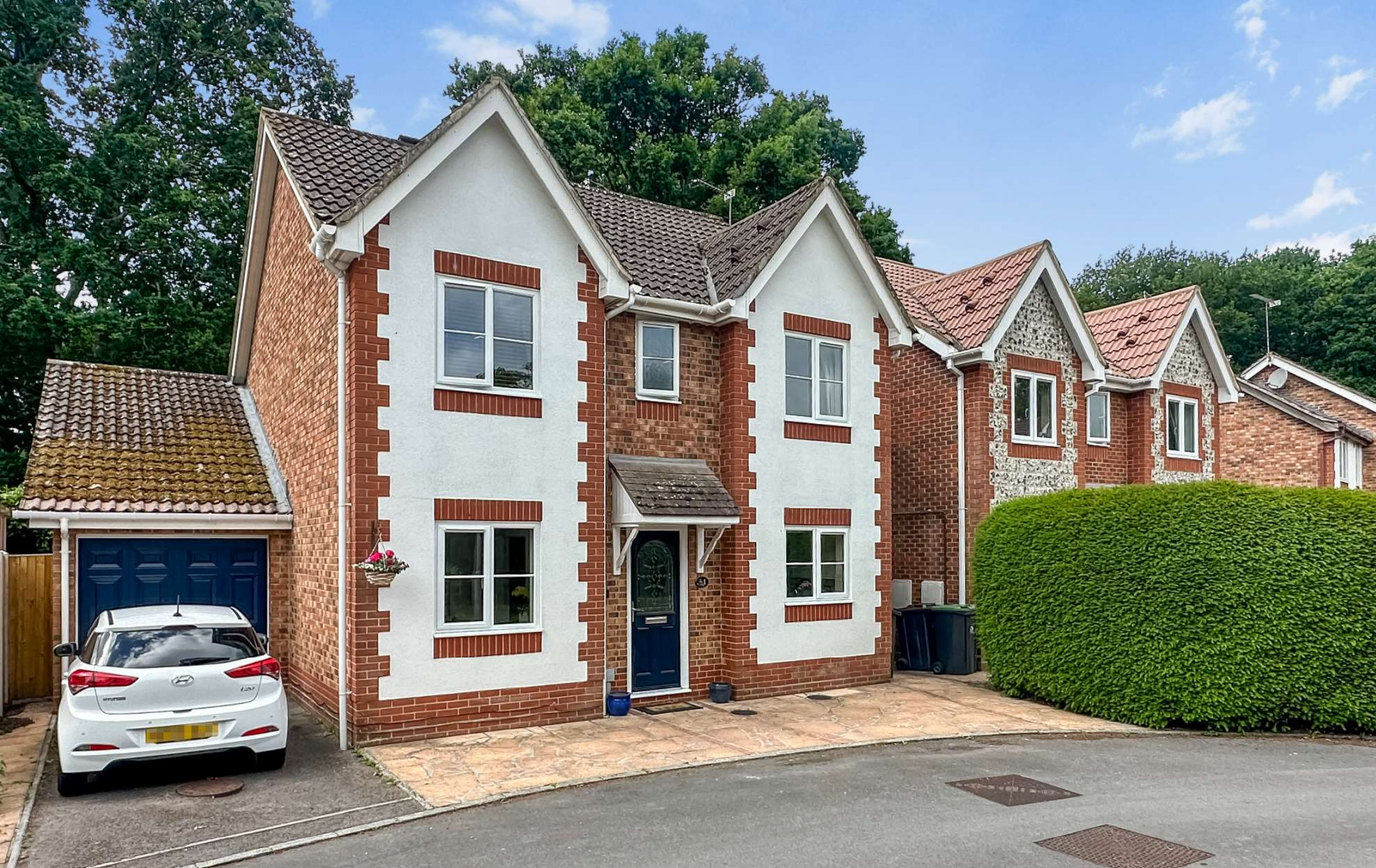
Oaks Mead Verwood BH31 6LJ Guide Price £525,000