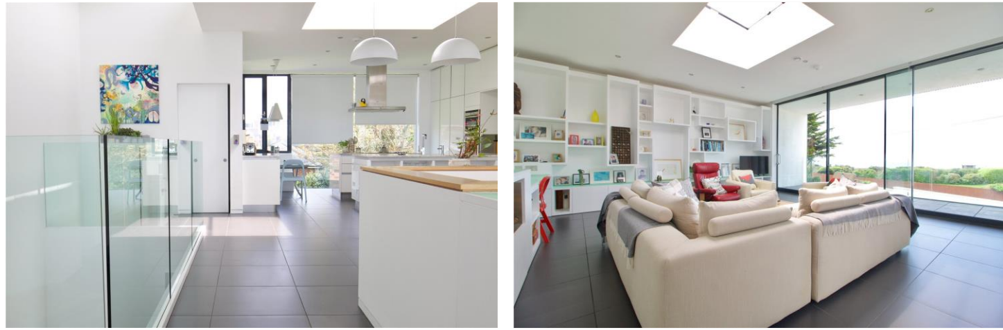
FREEHOLD, DE LA WARR ROAD, £1,895,000